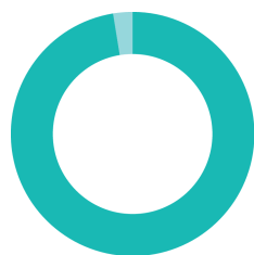
Security Type Breakdown (%)

To reduce Fund expenses, only one copy of most shareholder documents may be mailed to shareholders with multiple accounts at the same address (Householding). If you would prefer that your Brown Advisory, LLC documents not be househeld, please contact Brown Advisory, LLC at 1-800-540-6807, or contact your financial intermediary. Your instructions will typically be effective within 30 days of receipt by Brown Advisory, LLC or your financial intermediary.